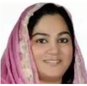
Jaipur, The Bharatpur police in Rajasthan has lodged a complaint against Congress MLA from Kaman,