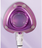
Ahmedabad, BD-India (Bection, Dickinson and Company) today announced the launch of a specialist educational program on chemo ports on World Cancer Day, observed on 4th February every year.